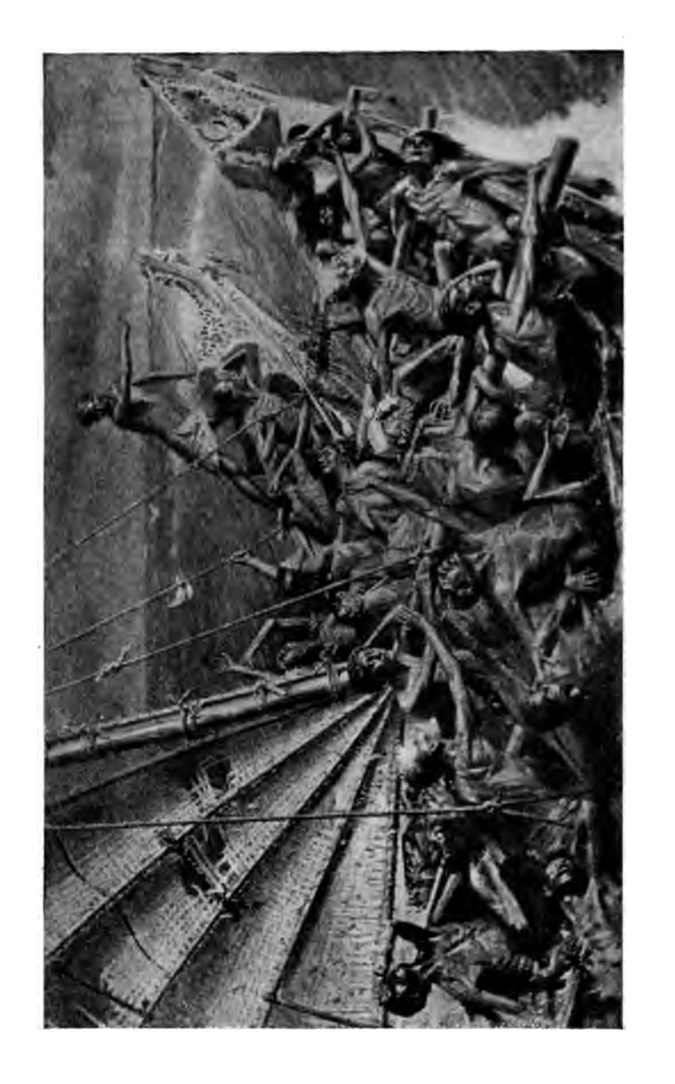
THE PEOPLE OF TURI'S CANOE, AFTER A VOTAGE OF GREAT HARDSHIP, AT LAST SIGHT THE SHORES OF NEW ZEALAND. From a painting in the Auckland Art Gallery by C. F. Goldie and L. J. Steele.